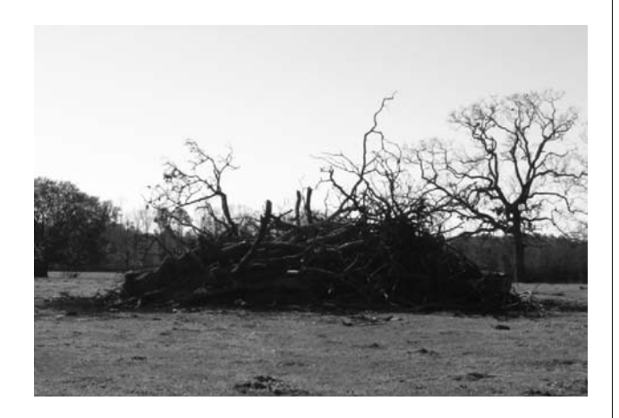
Debris at sites OIG visited had been burned or piled at various locations, which made it impractical to verify the extent of the damage.

Overall, we concluded that the flexibility provided to the States by FSA's ECP allowed them to better facilitate producers' timely recovery from damage caused by the successive hurricanes that devastated farmland throughout the Gulf Coast in 2005. FSA State offices were authorized to increase ECP approval limits and waive pre-approval onsite inspections of the extent of damage. However, we did find that FSA county personnel approved applications from both their fellow employees and their superiors, which was not allowed by procedure. Also, although FSA replaced its pre-approval onsite inspections with post-approval spot checks of 25 percent of approved applications, the spot checks did not always provide reasonable assurance that claimed costs were commensurate with the work or services performed; e.g., once debris had been removed, it was difficult to gauge the extent or location of the original damage and, therefore, the actual expenditures required to rehabilitate the land.