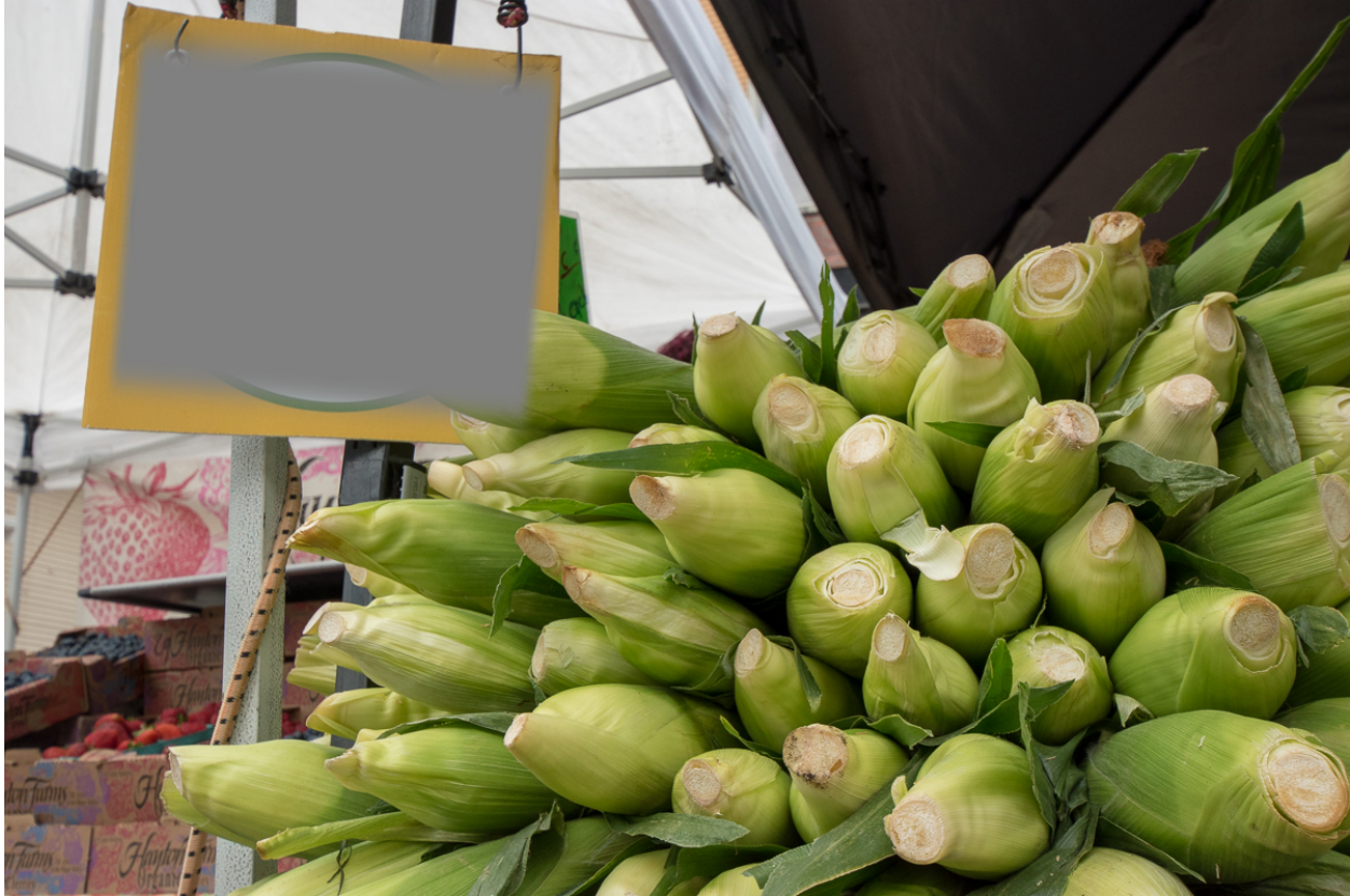
Figure 2. Local corn for sale at a farmers market. Image obscured to protect the privacy of program participants.

FMLFPP is an expanded version of FMPP, which was originally authorized in the 2002 Farm Bill. FMPP was amended by the Agricultural Act of 2014 to include LFPP. 1 The FMPP component develops new market opportunities for farm and ranch operations serving local markets by providing, developing, improving, and expanding outreach and training. Additionally, FMPP provides technical assistance and assistance in developing, improving, and expanding domestic farmers markets, roadside stands, community-supported agriculture programs, agritourism activities, and other direct producer-to-consumer market opportunities. The LFPP component offers grant funds with a 25 percent match requirement to support the development and expansion of local and regional food business enterprises. 2 These grants should increase domestic consumption of locally and regionally produced agricultural products and develop new market opportunities for farm and ranch operations serving local markets. AMS accepts two types of project applications under LFPP—planning grants 3 and