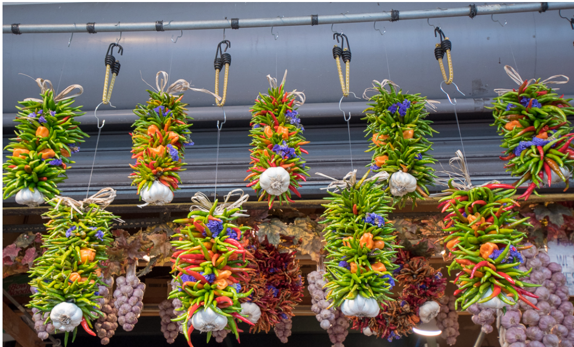
Figure 1. Local produce displayed at a farmers market.

The Farmers Market and Local Food Promotion Program (FMLFPP) is an Agricultural Marketing Service (AMS) grant program with outreach components intended to expand access to locally produced agriculture products and to develop new market opportunities for farmers, ranchers, and local/regional food businesses. FMLFPP accomplishes these goals through two competitive grant program components: (1) Farmers Market Promotion Program (FMPP) and (2) Local Food Promotion Program (LFPP).